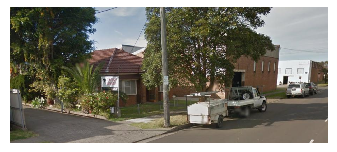
Site photographs – western portion of the site and its Atchison Street frontage