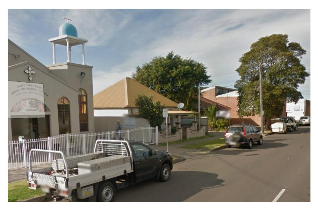
Site & surrounds photograph – the western portion of the site looking along the Atchison Street frontage of the site looking generally south-east; inclusive of the neighbouring Greek Orthodox Church