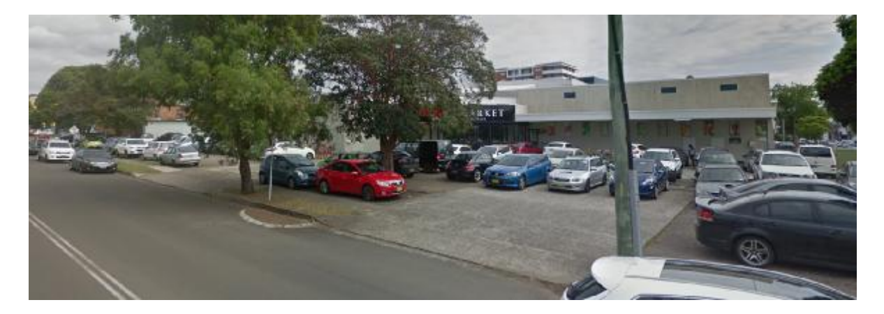
Site photograph – Ellen Street frontage of the site looking north-west