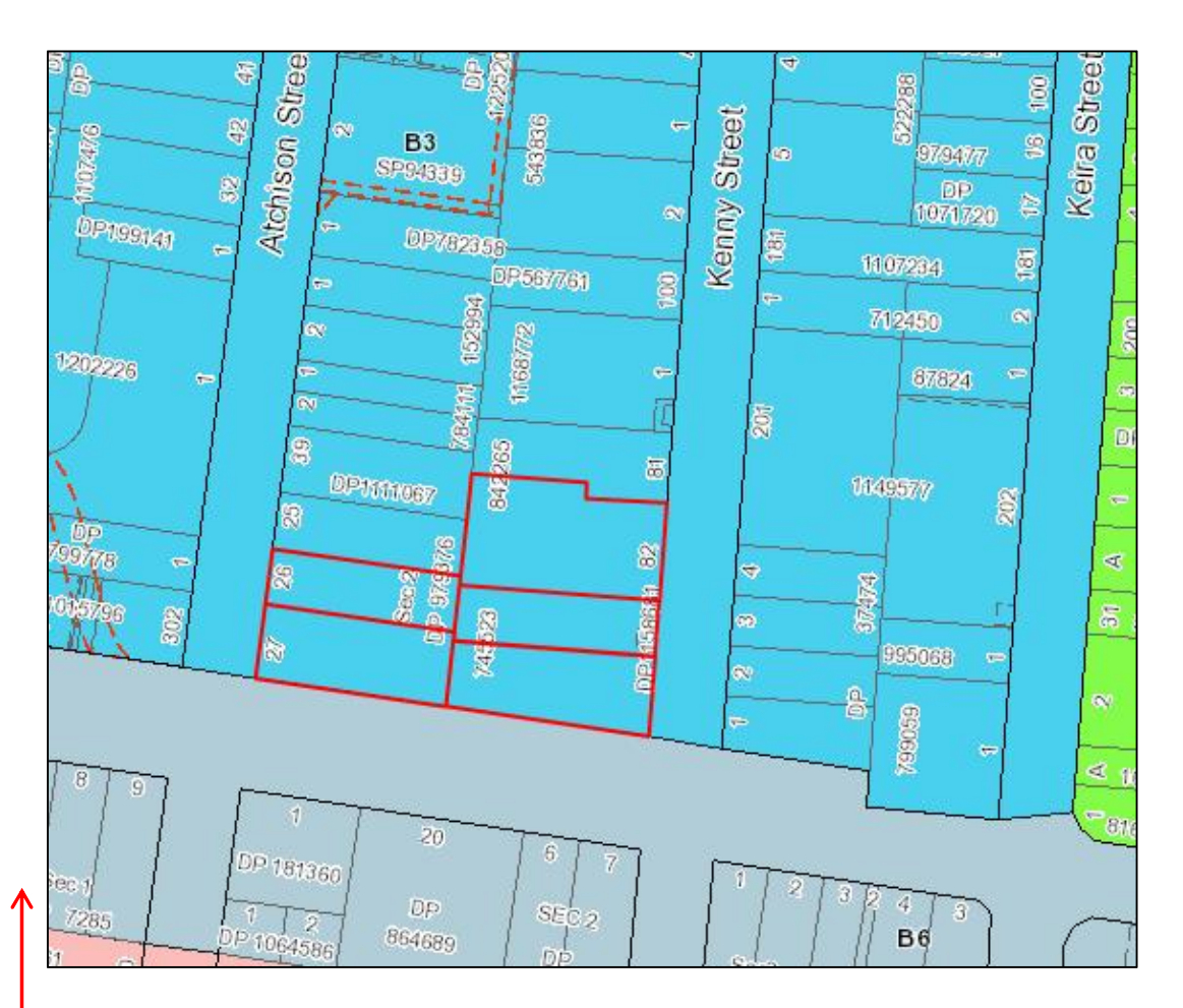
Wollongong Local Environmental Plan, 2009 Zoning Map