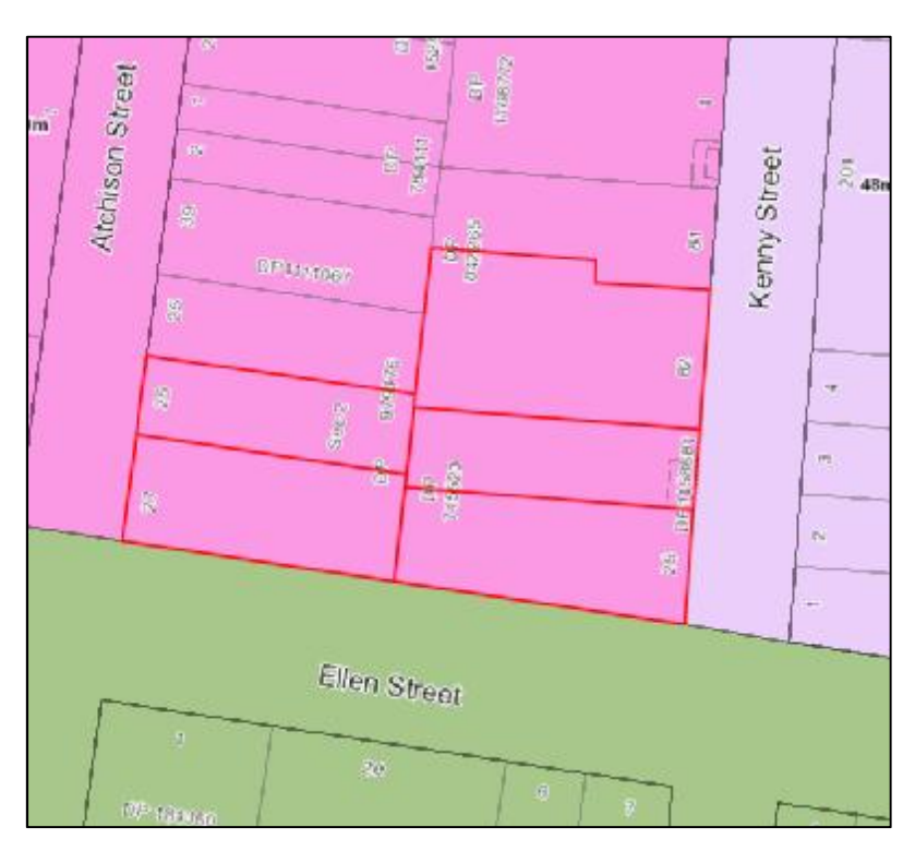
Wollongong Local Environmental Plan, Height of Buildings Map