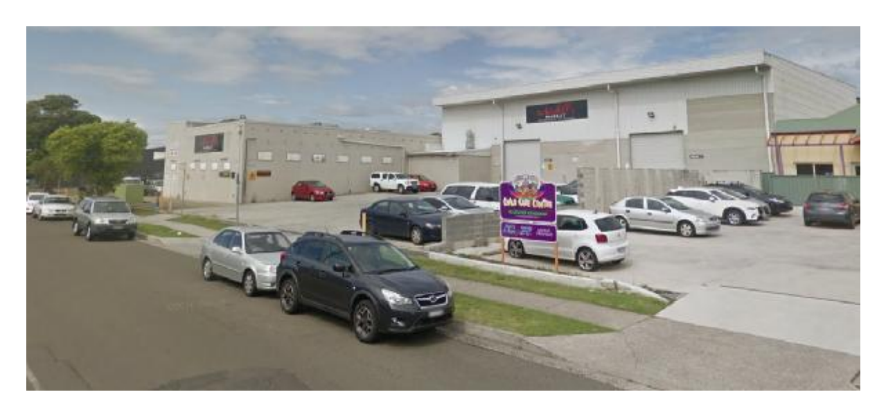
Site photograph – Kenny Street frontage looking south-west